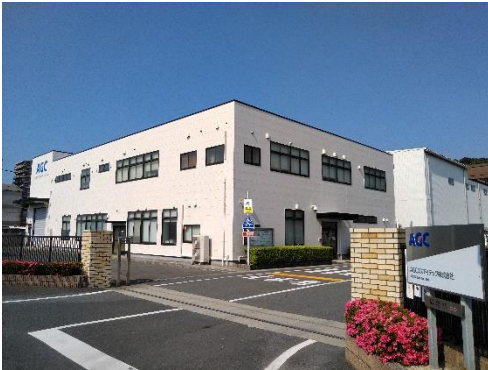
AGC Si-Tech headquarters

AGC (Headquarters: Tokyo; President: Yoshinori Hirai), a world-leading manufacturer of glass, chemicals, and high-tech materials, has announced that its 100% subsidiary AGC Si-Tech Co., Ltd. (Headquarters: Wakamatsu-Ward, Kitakyushu City) has decided to increase its production capacity of RESIFA™SUNSPHERE™ , a silica product that is an eco-friendly cosmetic material made from natural sources. At the Company's Wakamatsu Plant (Wakamatsu-Ward, Kitakyushu City), facility expansion will be implemented to increase production capacity by approximately 1.5 times that of the current level. Operations are scheduled to begin in the second quarter of 2025.