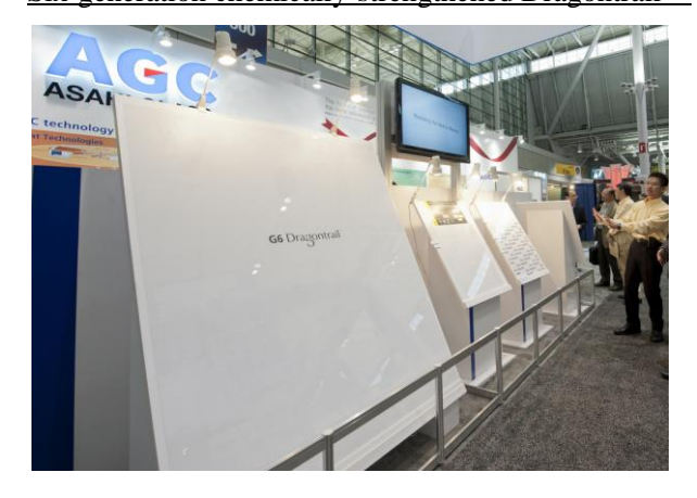
Six-generation chemically-strengthened Dragontrail<sup>TM</sup>

A key to efficient production of double-layered touchscreens is large-size chemically strengthened glass. A large number of cover glass with built-in touch sensor can be manufactured at a time by neatly arranging touch sensors on a large sheet of chemically strengthened glass and cutting the glass into pieces of the intended size. As the touchscreens manufactured based on this method are increasingly adopted for use in smart phones and tablet PCs in 2013 onward, AGC's high-quality G6-size chemically strengthened Dragontrail manufactured at the new facility will contribute to the creation of even thinner smart phones, tablet PCs, Ultrabook<sup>(*2)</sup> and other touchscreen devices.